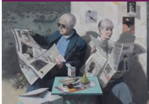
'The White Screen' Alexander Fraser, Oil