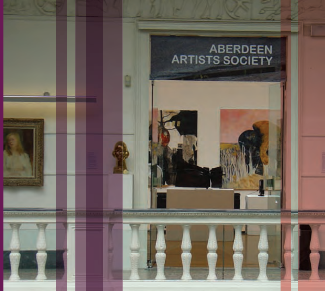
Aberdeen Art Gallery, Schoolhill